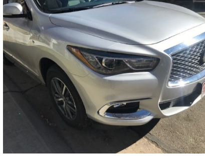
Point of Impact