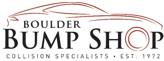
Photo Estimate Directions

Thank you for looking to Boulder Bump Shop to provide you with an estimate. Please keep in mind the photo estimate we provide is simply an estimate, and not a guarantee. There will likely be additional damages, parts, and labor required to complete the repair when we dis-assemble the damaged area.